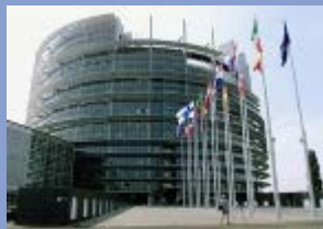
Authors: Gaël Brustier, Corinne Deloy, Fabien Escalona

Just as the national results have been validated, and the composition of the groups in the European Parliament finalised this paper offers a round-up of the European elections 22nd-25th May 2014. It combines an analysis per party "family" and parliamentary group. In each case the nature and relation entertained with the European Union is explained followed by the results and effects of these imply.