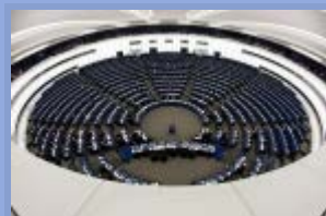
Author: Charles de Marcilly

Just seven weeks before the European Elections (22nd-25th May), the Robert Schuman Foundation has published an assessment of the 7th legislature of the European Parliament (2009-2014). This study highlights data published in the mid-mandate assessment undertaken at the beginning of 2012. The balance of power between political groups, an analysis of the quantitative action taken by parliament and the national delegations' work are assessed. This is followed by an evaluation of the major issues that have marked this term.