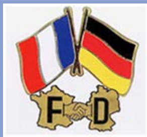
Author: Nicolas Sarkozy

The Robert Schuman Foundation has published a speech given by Nicolas Sarkozy (President of France 2007-2012) on the Franco-German friendship in Berlin on 28th February 2014 to the Konrad Adenauer Foundation.