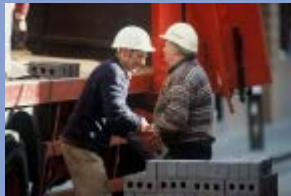
Author: Sébastien Richard

The situation of the posted worker in view of the social laws of the host country is addressed by the 1974 regulation, modified in 2004, which maintains the posted worker's affiliation with the social security regime of the sending State and by the 1996 directive which endorses the application of the salary, working hours and conditions of the host country except if the standards of the sending country are more advantageous. With growing numbers of cases of fraud in a context in which there have been increasing numbers of posted workers in the wake of the enlargement of 2004-2007, the European Commission has put forward a draft implementing directive designed to prevent the circumvention of the 1996 directive.