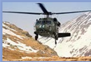
Author: Arnaud Danjean

Just one month before the European Council on 19th and 20th December which will be devoted in part to questions of Defence and just days before the meeting of the 28 Defence Ministers in Brussels and the assessment in plenary session by Parliament of the reports on the implementation of the common security and defence policy the Robert Schuman Foundation has published an interview with Arnaud Danjean, Chair of the European Parliament's Security and Defence sub-committee.