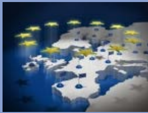
Author: Claude Bartolone

This European Issue covers parts of the speech delivered by the leader of the French National Assembly, Claude Bartolone, as he closed the Robert Schuman Foundation's conference on the role played by national parliaments in European integration which took place on 2nd October 2013 at the National Assembly. Read more