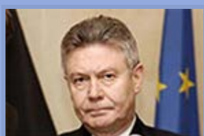
Author: Karel De Gucht

The Robert Schuman Foundation has published an interview with the European Commissioner for Trade, Karel de Gucht. In his opinion "an agreement with the USA could help end the stalemate. The USA was doubtful about the inclusion of regulatory issues concerning financial services, but at this stage the question is still being discussed. One of the main aims of the negotiations is to ensure that European businesses are no longer subject to the "Buy American" act. He adds that (following) " the implementation of the agreement with South Korea our exports increased by over 16% in one year, providing the EU with a positive trade balance with this country for the first time in 15 years. If we conclude all of the on-going negotiations successfully we could see a 2.2% increase in European GDP."