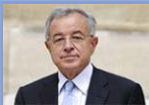
Author: Alain Lamassoure

On 13th March 2013 the European Parliament announced its rejection of the draft EU budget (multi-annual financial framework), for the period 2014-2020 adopted by the European Council on 8th February last. A resolution adopted 506 votes in support, 161 against and 23 abstentions ("the European Parliament rejects this agreement as it stands because it does not reflect the priorities and concerns that it expresses"), demands modifications (and therefore negotiations) in view of an approval in July. Alain Lamassoure, chair of the European Union's Budgets Commission describes what he deems to be a real European budget.