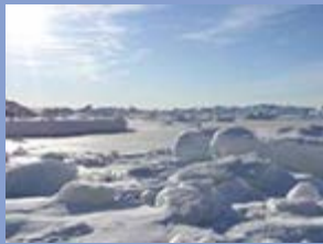
Author: Damien Degeorges

Over the past few years the effects of climate change have led to an increasing interest of the world's major powers in the Arctic. The issue at stake is not restricted simply to the climate but it is also of economic and strategic interest. The Arctic is revealing itself to be the new frontier in terms of international relations between America, Europe and Asia. If given the necessary means the European Union, a regional player, has an opportunity to assert itself. The strengthening of its relationship with Greenland, a key area for future development in the Arctic, is of vital importance for the European Union.