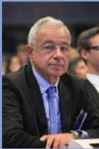
Author: Alain Lamassoure

Negotiations over the European budget are in full swing. The 2012 budget has not yet been settled, negotiations over the 2013 budget are in stalemate, and those concerning the Multi-annual financial framework are the focus of bitter discussion between the European institutions and the Member States. In a European interview Alain Lamassoure (EPP, FR) Chairman of the European Parliament's Committee on Budgets, give us his interpretation of the situation.