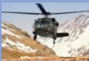
Author: Maxime Lefebvre

The Robert Schuman Foundation has published a European Issue by Maxime Lefebvre on Europe as a world power. The present crisis experienced by the European Union is pushing it towards greater thought about its future. If the European Union emerges more united, showing greater solidarity it might then find the means to strengthen its presence in the international arena. It would be vain to understand the idea "of Europe as a world power" as one which is Westphalian with a completely harmonised foreign and defence policy. The European Union is developing its "smart power" which is mid-way between "hard power" (military power) and "soft power" (the art of persuasion). Finally successful cooperation between the Member States and the Brussels' authorities is the prerequisite for the assertion of "a powerful Europe".