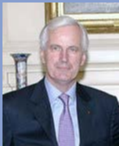
Author: Michel Barnier

This week the Robert Schuman Foundation has published a European Interview with Michel Barnier, European Commissioner for the Internal Market and Services. He presents the Commission's most recent proposals regarding the ratings agencies. To control some of the most dangerous banking activities he suggests, amongst other things, to set out a regulatory agenda. On the issue of the completion of the single market he lays down the principles of more innovative, greener, more inclusive growth that is richer in jobs. He finally mentions a modernisation of the SOLVIT network as well as the introduction of a single European patent.